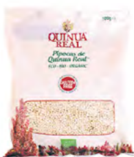
PUFFED QUINUA REAL